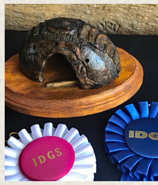
Emma Kent - Division Youth 11