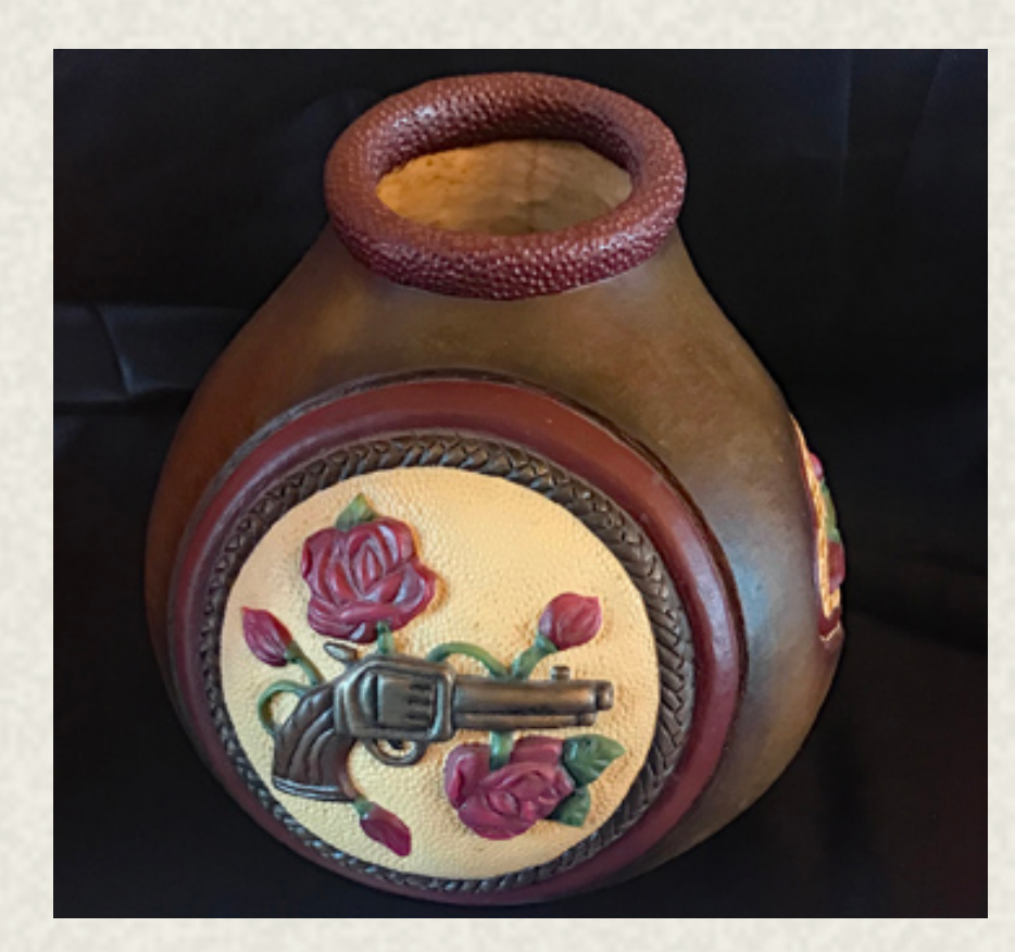
Rhonda Cotes - Expert Division