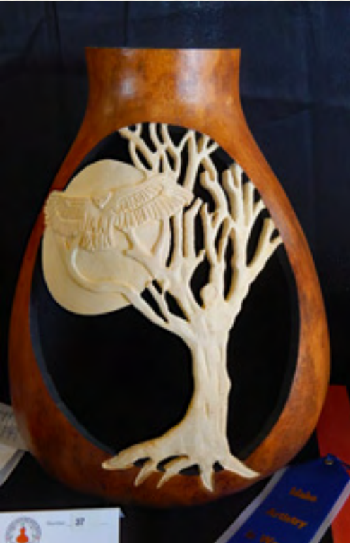
Sculpture - Steve Kiser

The following pages show a few of the individual Gourd Entries, and several pictures of the IAW Gourd display. Apologies if I have missed your gourd. I hope to add additional photos in future "Shards"