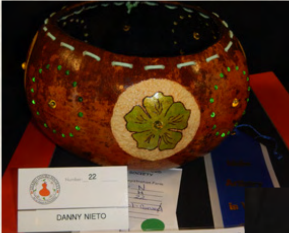
H -Mixed Media