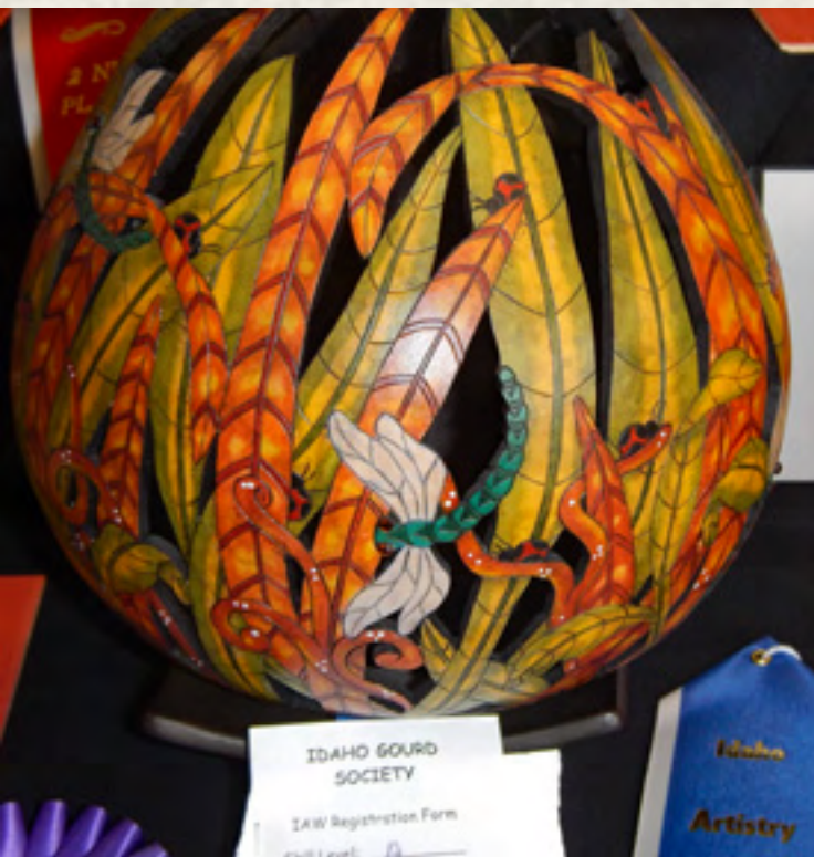
Peoples Choice - Linda Kobel